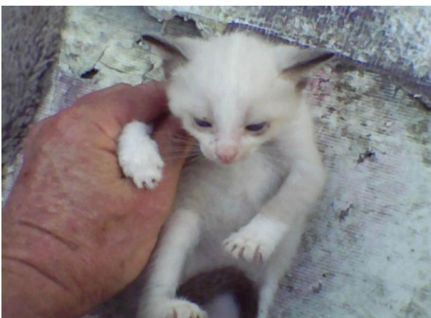
Above, rat-killing working cats are bred for use in rodent abatement. PAGE FIVE